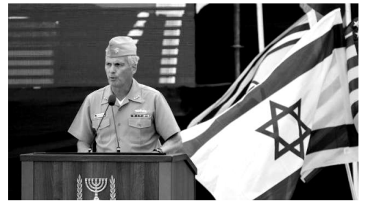
BY THEHILL.COM, 9-18-17 (EXCERPT:)

Israel and U.S. officials on Monday inaugurated the first permanent American military base in the country, which will house dozens of U.S. troops and a missile defense system.