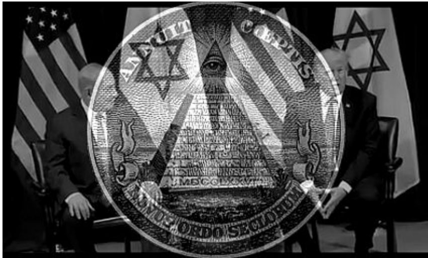
NEW YORK CITY – "Make the United Nations Great."

That's how President Trump described his message to world leaders this week, as he made his first visit to the U.N. as commander-in-chief.